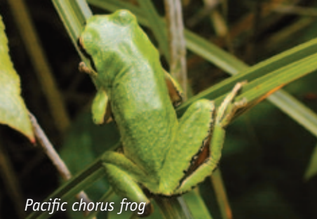
Pacific chorus frog

PRINTED ON 100% POST CONSUMER RECYCLED PAPER