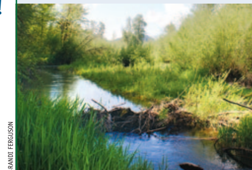
Beaver dam at Berggren Watershed Conservation Area.