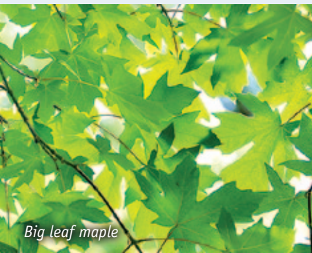
Big leaf maple

The McKenzie River Trust protects and cares for special lands and the rivers that flow through them in western Oregon.