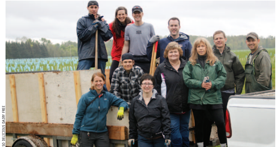
SO DELICIOUS DAIRY FREE