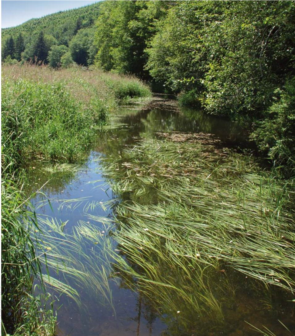
ECOTRUST FOREST MANAGEMENT

Fivemile Creek provides critical coho salmon habitat. Because of you, this land is now permanently protected.