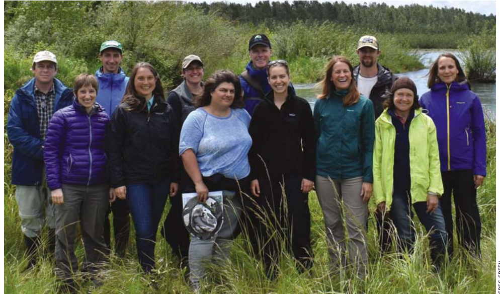
McKenzie River Trust Staff on Green Island, May 2017.