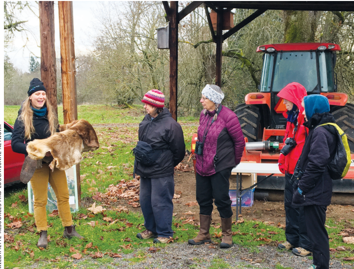
WILLAMETTE RESOURCES AND EDUCATIONAL NETWORK