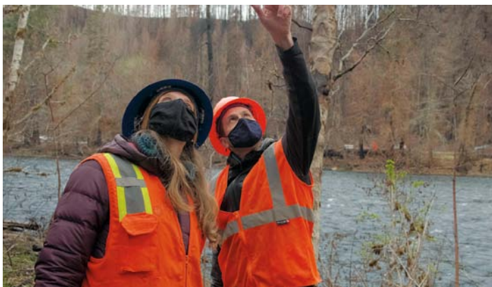
MRT Staff joined other Pure Water Partners to assess land after the fires, providing landowners with recommendations for erosion control and other hazards. Learn more at purewaterpartners.org