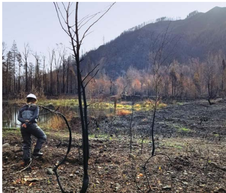
The Finn Rock Reach conservation area was burned, but we are feeling hopeful about restoration and recovery for this habitat and beloved recreation area.