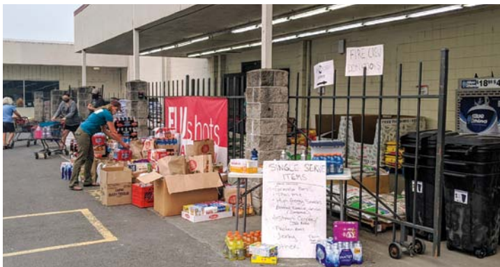
MRT Staff collected truckloads of dry goods and beverage donations during the wildfires from caring community members.

The impact of the Holiday Farm Fire in September reverberated through us in a way that nothing else did this year. Through all the shock and grief, we found hope in people like you. Thank you to everyone who gave time, money, and resources to help those affected by the fires.