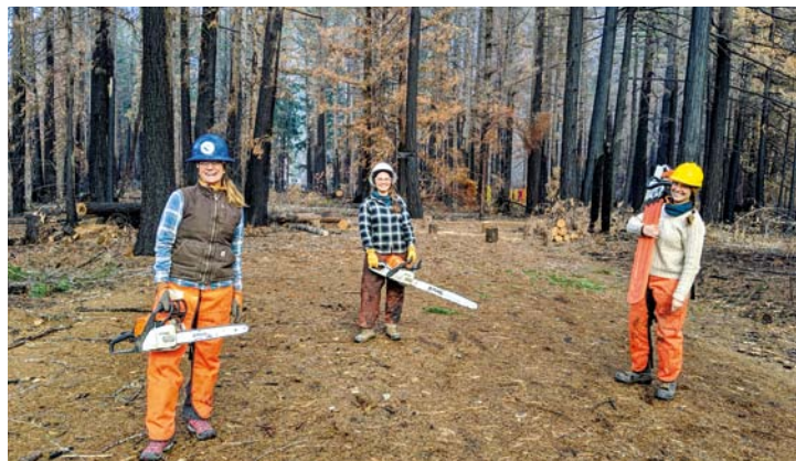
Staff members worked with partners Northwest Youth Corps to hone their chainsaw skills while supporting cleanup efforts in the Blue River area.